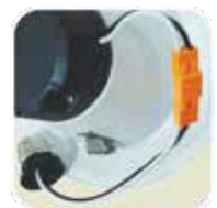
Connect pigtail to fixture