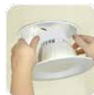
Slide fixture into recessed can