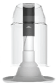
Length extended to reach the socket