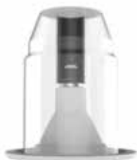
Trim flush with the housing